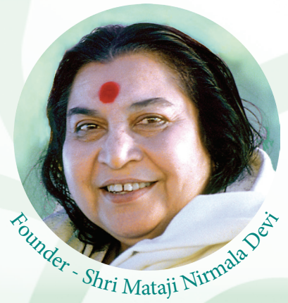
Founder - Shri Mataji Nirmala Devi