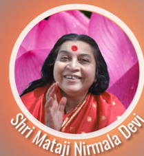
Shri Mataji Nirmala Devi

Little by little, we practice every day to cleanse our inner system using powerful techniques of Sahaja Yoga Meditation. This is a spiritual meditation whereby we awaken the inner energy that gently brings positive change within us - making us more balanced, peaceful and joyous. As you participate in the daily classes, you will notice increasing gap between your thoughts and feeling more relaxed, peaceful and spiritual. Sahaja Yoga Meditation is always free and practiced in more than 100 countries.