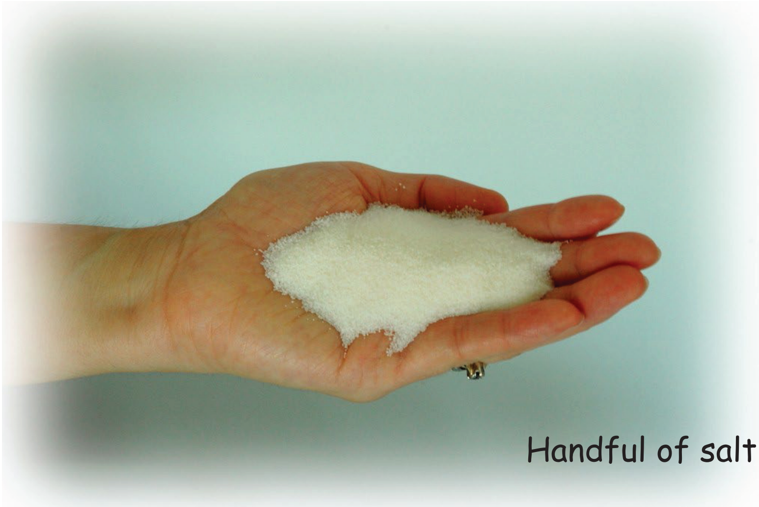
Handful of salt