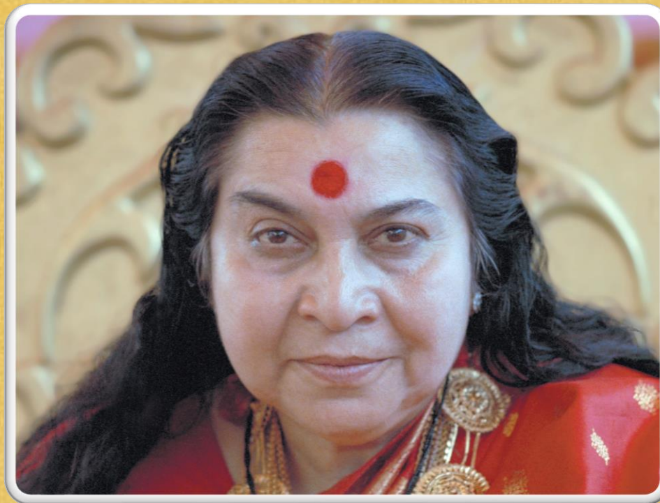
H. H. Shri Mataji Nirmala Devi